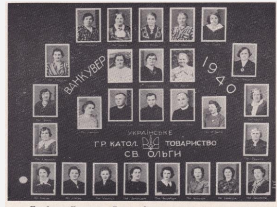
Українське Католицьке Т-во св. Ольги основане 11 серпня 1938. St. Olga's Ukrainian Catholic Women's Organization organized August 11, 1938.

As the League's membership grew, the activity of the Society of St. Olha diminished and, at its General Meeting in 1953, the membership decided to disband the Society.