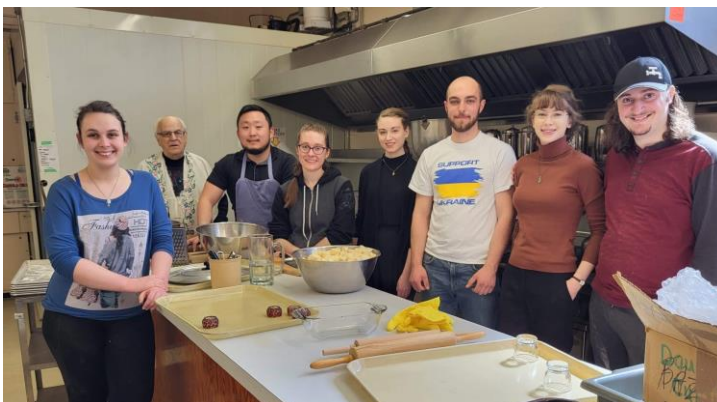
The Fellowship and Faith of the 2024 Youth of St Mary's Parish